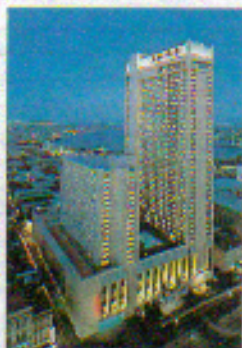
Renaissance Pere Marquette Hotel and Resort August 16, 2010 through August 20, 2010 on off the French Quarter

Join us in NEW ORLEANS for the 42 nd Annual Convention