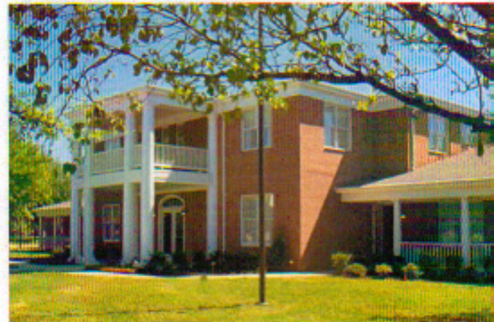
Michael E. DeBakey VA Medical Center Fisher House