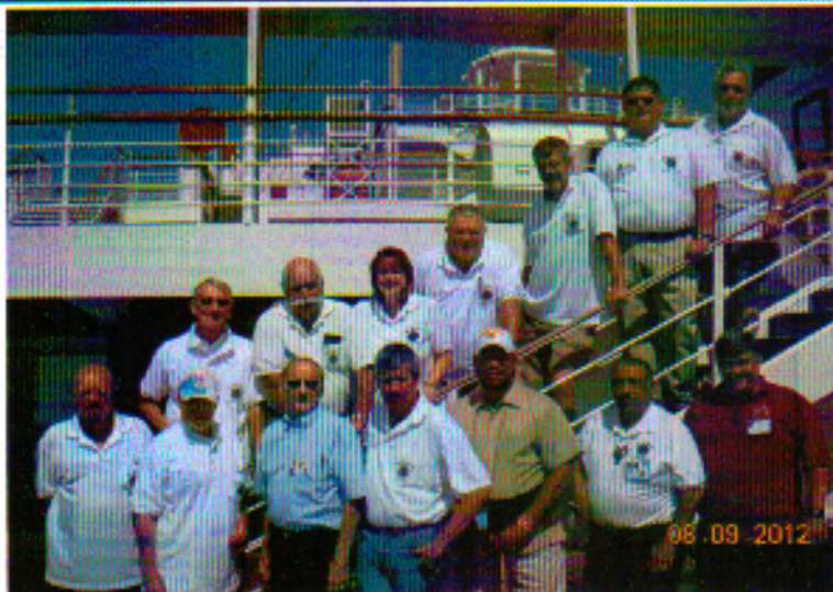
Members in attendance at the 2012 Annual Meeting onboard the Queen Mary